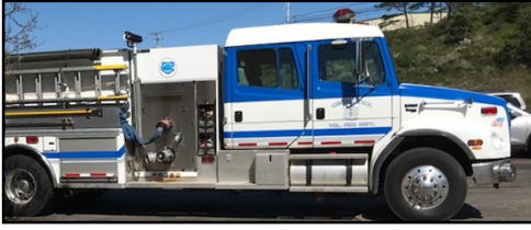
Center Township fire truck

On September 28, BCRC continued its longstanding tradition of Safety Day. The annual training is designed to meet requirements mandated by the Commonwealth of Pennsylvania and the Occupational Safety and Health Administration (OSHA).