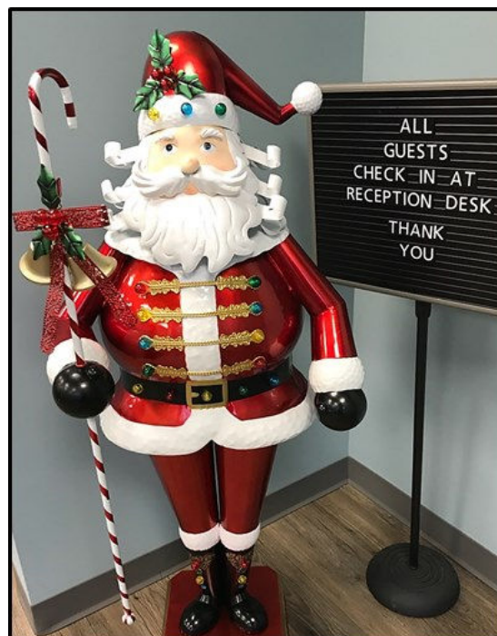
Jolly Old Saint Nicholas stands guard while conveying holiday cheer to the visitors and clients entering the new East Entrance at CenterPlace.