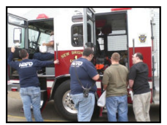
New Brighton firemen give tour of a fire truck to BCRC clients

The annual safety carnival was held on a beautiful September afternoon. The festivities began with a picnic lunch followed by safety themed games and prizes. The New Brighton Fire Department was on hand for anyone who was interested in checking out the fire truck and related equipment. The carnival was a fun way to celebrate BCRC's excellent safety record.