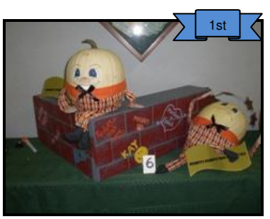
Humpty Dumpty 1<sup>st</sup> place staff choice.