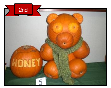
Honey Bear 2<sup>nd</sup> place staff and client choice.