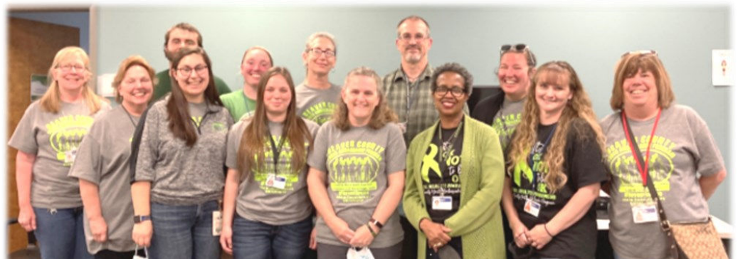
Staff members from BCRC's School to Work program pose for photo wearing green in support of National Mental Health Acceptance and Awareness