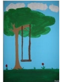
"Fun Times in the Summer"