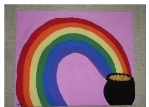
"Somewhere Over the Rainbow"