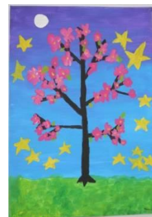
"No Trees on a Spring Day"